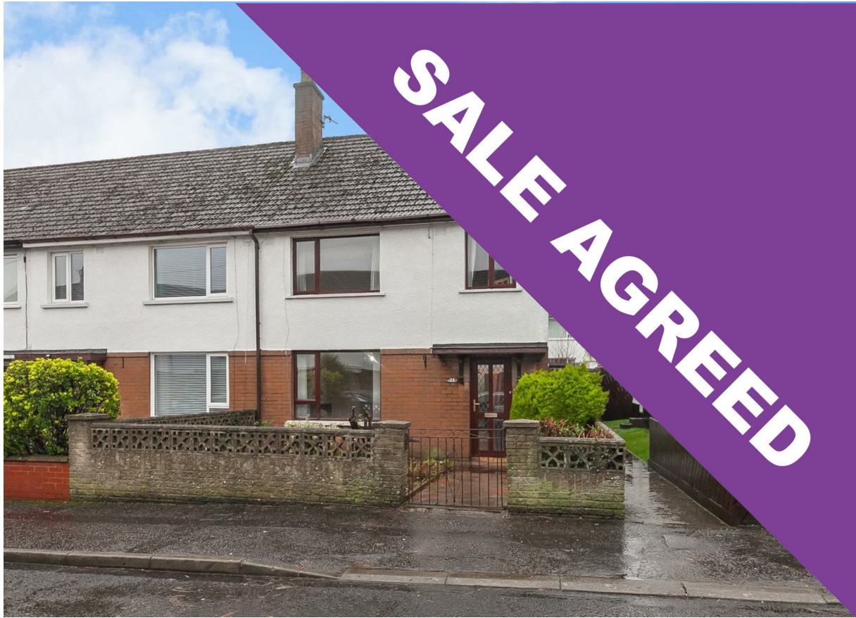
28 Kings Crescent, Newtownabbey, BT37 0DJ